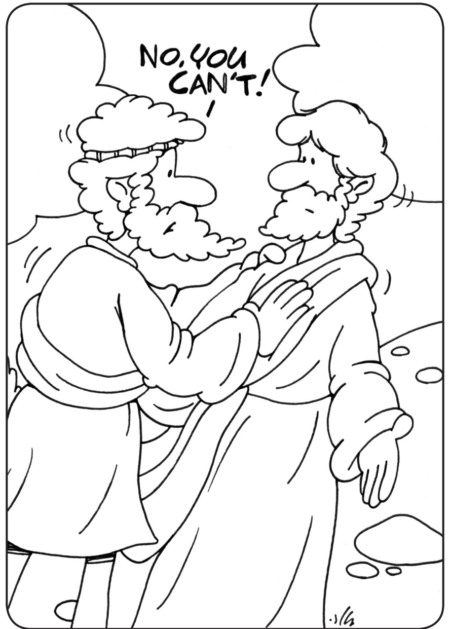
Peter took Him aside and began to rebuke Him. Matthew 16:22

Permission to copy granted for one-time use on August 30, 2020, only.